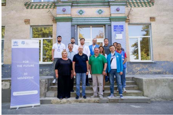
School team, LWF Ukraine staff, UNHCR representatives, and local authorities at the opening of Katerynivka school.