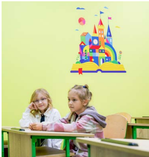
Second grade students in their classroom at Katerynivka school.