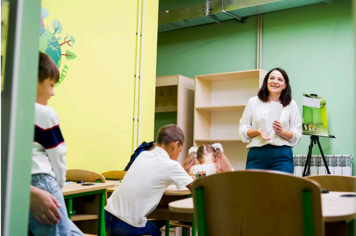
Students and teacher at the opening of Katerynivka school in Kharkiv.

Katerynivka, Kharkiv region — September 4, 2025. A newly rehabilitated underground school space has been opened in the bomb shelter of Katerynivka school, allowing 150 students to safely return to their studies. This is the final educational facility completed under the joint project of the Lutheran World Federation (LWF) in Ukraine, the UN Refugee Agency (UNHCR), ACT Alliance, and the NGO Common Cause for People, in close coordination with the Kharkiv Regional State Administration and local authorities.