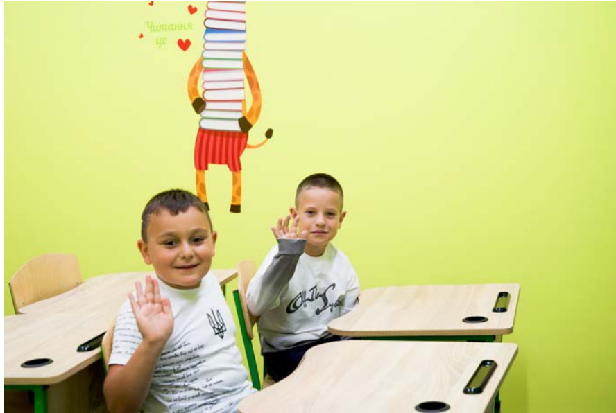
Second grade students in their classroom at Katerynivka school.

According to the Ministry of Education and Science of Ukraine, since the beginning of the full-scale invasion 4,139 educational institutions have been damaged, with 394 completely destroyed.