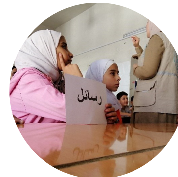
AI-Qadisiah School Community

“These children are like my own. Seeing the solar system installed felt like it was for my own home.”